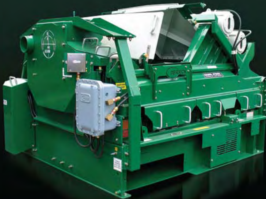
DUAL POOL 626 VE™ (With Optional Scalping Deck and Vacuum Extraction)

*VE™ option: add approximately 234 lbs. / 106 Kg on the DP 616/626, and approximately 246 lbs. / 112 Kg on the DP 618/628