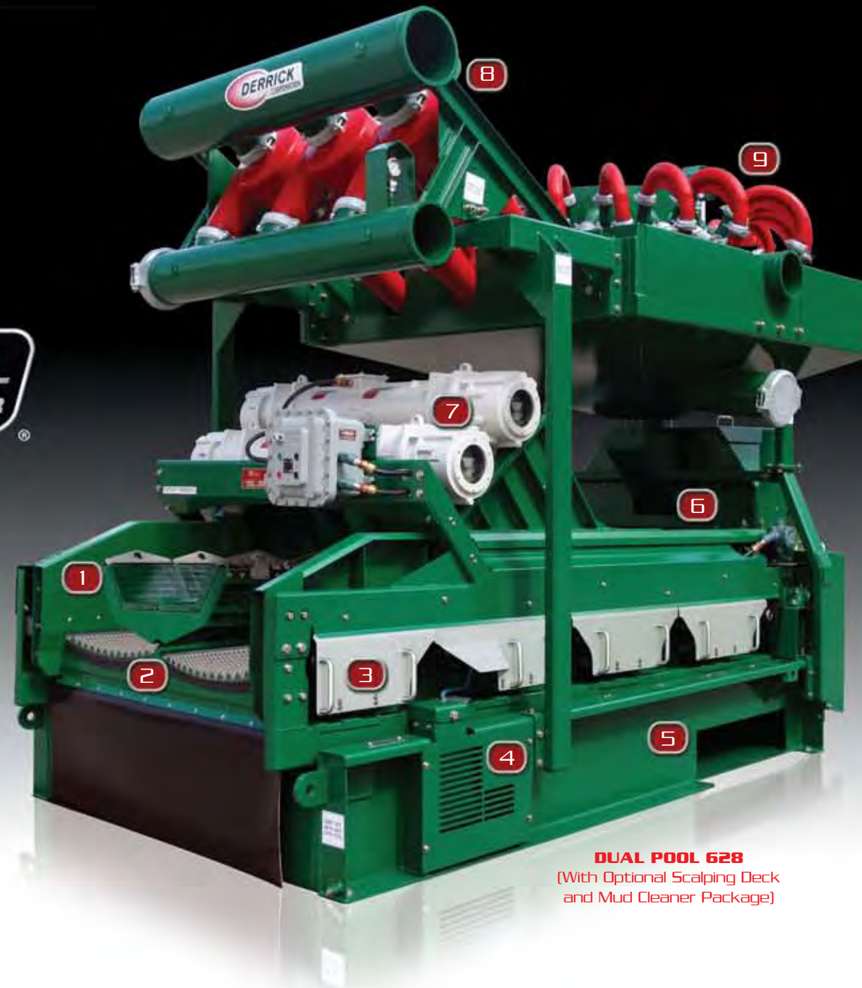
DUAL POOL 628 (With Optional Scalping Deck and Mud Cleaner Package)