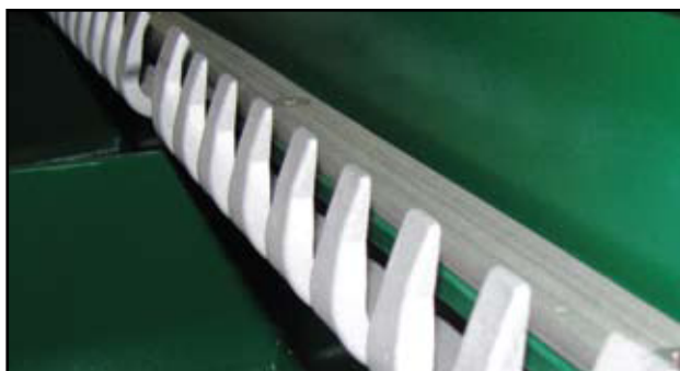
Under-Side Tensioning Fingers