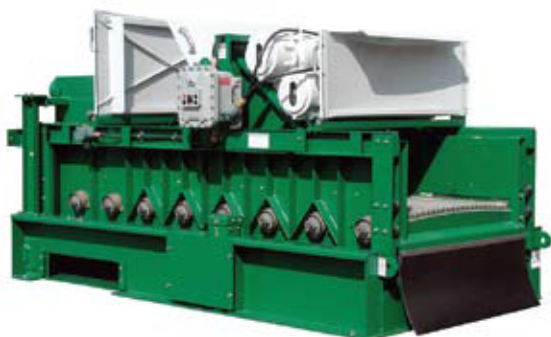
Derrick FLC 514 VE