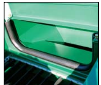
Low Weir Feed