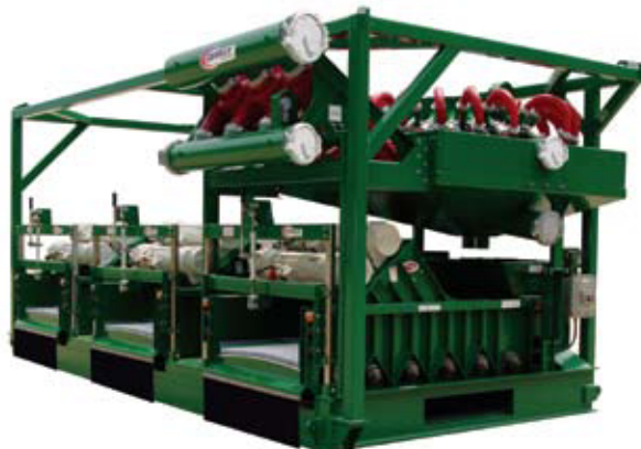
Triple FLC 503 with Optional Cone Package and Superstructures