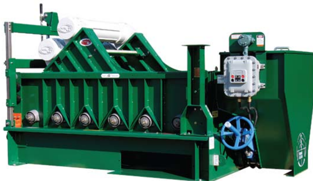
Derrick FLC 503 with Low Weir Feed

The high G shaker system consisting of FLC 503 and 504 series shakers enables a drilling rig to use fewer shakers, or to screen finer with the same number of shakers, producing significant savings in drilling fluid and disposal costs. Its proven performance and durability are an asset for any drilling program.