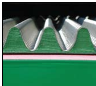
PYRAMID PLUS (PMD+™)