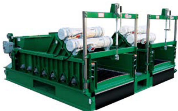
Dual FLC 504

The Dual and Triple FLC 503/504 is a single skidded unit configured with a common back tank and center cement by-pass with gate valve. Standard features include “greased-for-life” Super G vibrating motors, single-side tensioning system, and adjustable while drilling (AWD) deck angle adjustment.