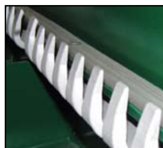
Under-Side Tensioning Fingers