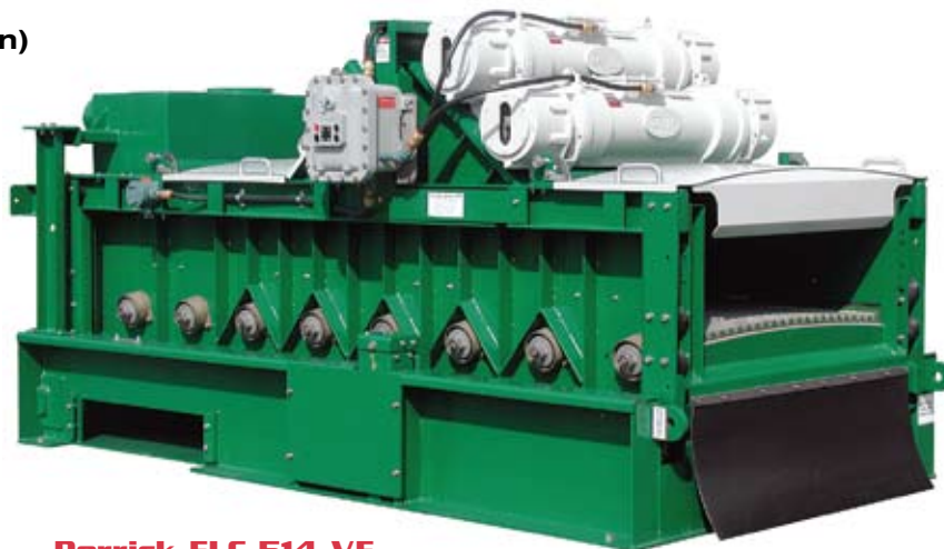
Derrick FLC 514 VE

To avoid exposing personnel and surrounding equipment to vapors, the screening surface is covered with self-locking hood. An exhaust fan connected to the feeder creates a vacuum, which removes unwanted process vapors and creates a continuous flow of fresh (ambient) air into the machine. Screening surface inspection, panel change and maintenance are easily accomplished by lifting the hood doors up thus permitting full access to the screen bed. The FLC 513 VE is a 3-panel shaker (adjustable from -1° to +5°) while the FLC 514 VE is a 4-panel shaker (adjustable from -1° to +7°).