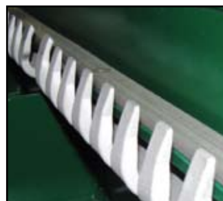
Under-Side Tensioning Fingers