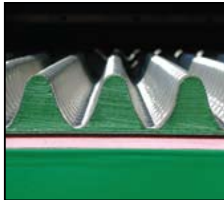
PYRAMID PLUS (PMD+™)