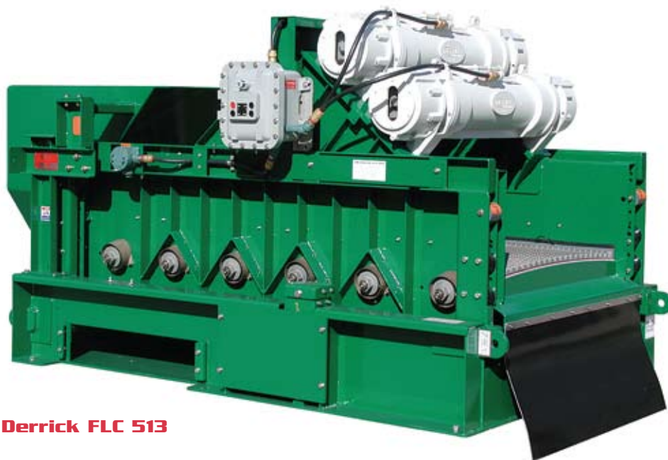
Derrick FLC 513

The High G shaker system consisting of FLC 500 series shakers enables a drilling rig to use fewer shakers, or to screen finer with the same number of shakers, producing significant savings in drilling fluid and disposal costs. Its proven performance and durability are an asset for any drilling program.