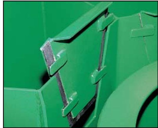
Positive sealing weir gates are removable, allowing flow per selected shaker or installed omitting flow.